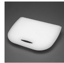
AC24 Synthetic Preparation Board