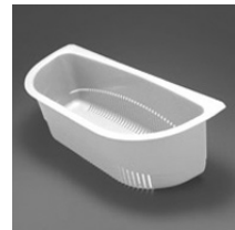
AC72W 'D' Colander